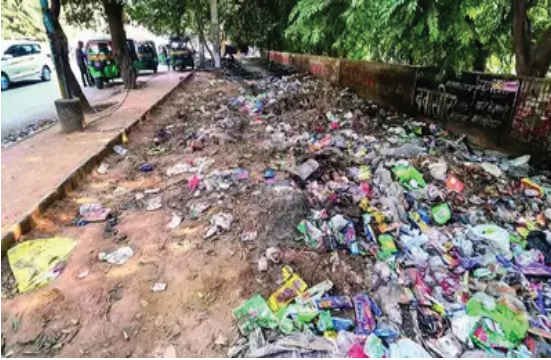
collection vehicles required in the zone-1 area.