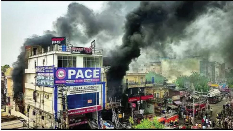
Police diverted the traffic from parallel roads during the fire fighting hours to ensure free movement of fire tenders around the building, said an official.