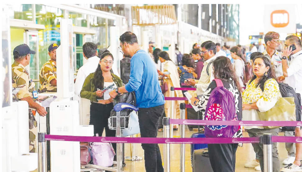
congestion. Between 6-7 am today, the system continued to experience glitches while issuing boarding passes. However, the scenario improved later in the day. In contrast to the chaos, most flights managed to stay on schedule, with the waiting period at Terminal 3 departures averaging around 3 to 5 minutes. The

New Delhi: The Ministry of Civil Aviation on Saturday said that flight operations were smooth and airline systems were back to normal across all airports a day after a global Microsoft outage led to flight cancellations and chaotic scenes at check-in counters. In a statement, the ministry said all issues related to travel adjustments and refund processes were being taken care of. "Since 3 am, airline systems across airports have started working normally. Flight operations are going smoothly now. There is a backlog because of disruptions yesterday, and it is getting cleared gradually. By noon today, we expect all issues to be resolved," the Aviation Ministry said. However, the IGI Airport in Delhi faced significant disruptions on Saturday morning as the Digi Yatra system, a biometric-based boarding system, remained non-operational. Long queues were observed at the departure terminals as passengers struggled to check in manually. Airport authorities have deployed additional staff to assist travellers and manage the