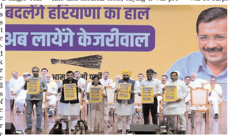
बदलोगे हरियाणा का हाल अब लायेंगे केजरीवाल

thing. It is not less than a miracle,' she said. 'He was born on August 16, 1968. You will be surprised to know that on that day, it was 'Krishna Janmashtami'. It is not a coincidence. I feel that God wants to get something done through him. Otherwise a boy born in a village who is from an ordinary family and he became the CM of Delhi,' she said. 'Arvind ji started with zero and he floated his own party and became the CM. Is it not surprising?' she asked. He shook the country's politics and he did such things which the old parties could never do, she said. 'Today in the entire country and world, people know him for his works,' she said as she spoke about his works. 'Kejriwal did a lot of things. I want to ask you, is there any party which I improved the condition of hospitals and schools and set up mohalla clinics and made electricity free,' she asked.