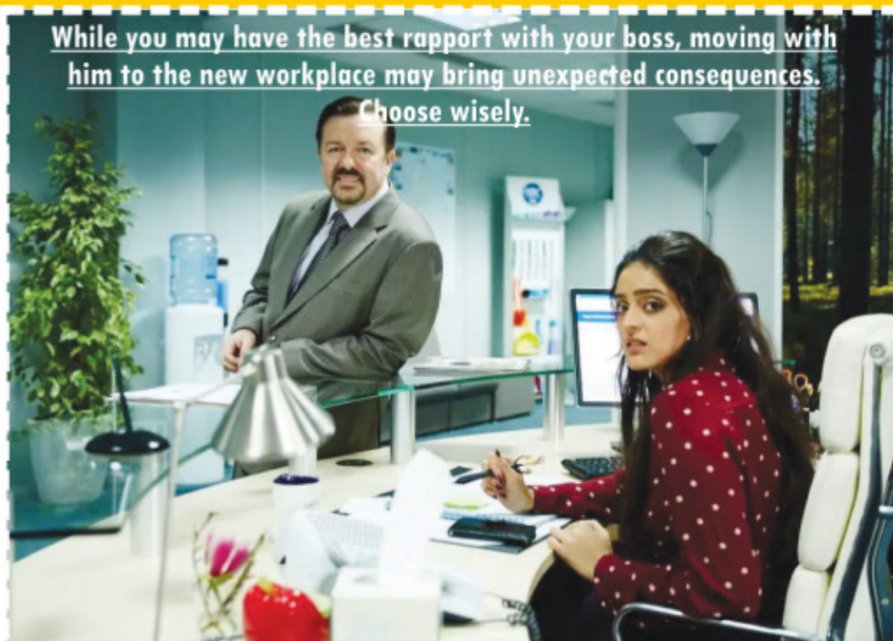
While you may have the best rapport with your boss, moving with him to the new workplace may bring unexpected consequences. Choose wisely.

cash pay, an ideal scenario would be where benefits and cash components both increase at a similar pace, but that is too idealistic in a crunch economy like ours.