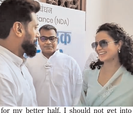
ally. Also as a Member of Parliament, I am accountable directly or indirectly to 25 lakh people in my constituency and as a cabinet minister, I have responsibility across the country. "I do not think I can take this lightly. And yes, no director, producer, including Kangana herself, will agree to do a movie with me," he said. Asked if he would do a movie with Ranaut, Paswan said, "She will not. She knows how good an actor I am." "I am a very bad actor. You need to be honest with yourself," he added. The Hajipur MP, who is among the few bachelors in the Lok Sabha, also said he has no plans to get married as of now. Asked if he is getting any marriage proposals, he said, "I do not know. I think my mother is processing most of it." "I don't know how to answer these questions... I have already started blushing," Paswan said with a bashful laughter. He added that his work is his priority for now, especially since the Bihar assembly polls are due next year.

polls from Mandi in Himachal Pradesh, Paswan's debut film came back to the limelight and many social media users said they would like to see them together on the silver screen again. He, however, was quick to rule out any possibility of a comeback. Asked if he would ever consider returning to cinema, Paswan quipped, "Again? After one disaster!" "No, not at all. And I think anybody who has seen the movie will agree with me," Paswan said. He smilingly added that his short stint in Bollywood has taught him what not to do in life. However, his stay in Mumbai also exposed him to the struggles of people from Bihar and firmed his resolve to do something for them through politics. Though he started as an actor, Paswan said, he realised it was not his calling. Politics is not something to be taken casually, he said. "I think politics comes with a huge responsibility and you cannot take this profession casu-