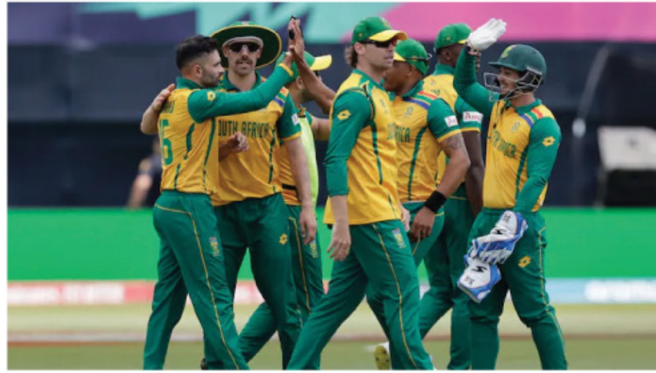
South Africa vs Nepal, T20 World Cup Highlights

T20 World Cup 2024: Aiden Markram's South Africa survived a huge scare after beating Nepal by 1 run in St Vincent to finish with wins in all matches in the group stage.