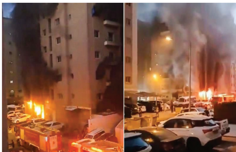
Kuwait received over 16,000 complaints from Indian citizens working there between March 2021 and

Those under scrutiny include the companies that hire foreign workers and the realtors who provide accommodation, besides travel agents who facilitate recruitment. According to reports, India's embassy in