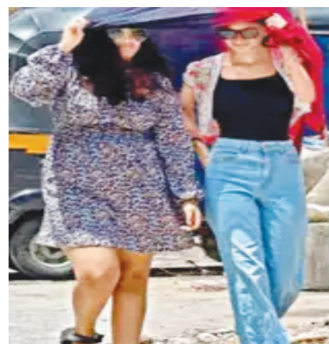
region to cool down. The residents thus

In Banyan city Vadodara too, heat was relentless all through the day recording maximum and minimum temperature of 44.2 degrees and 31.8 degrees respectively. According to data from India Meteorological Department (IMD), these three cities have not recorded temperatures below 30 degrees for the past four days in a row. Public health experts said that when the maximum temperatures cross 42 degrees and minimum temperatures fail to go down below 28 degrees, it does not allow a specific city or