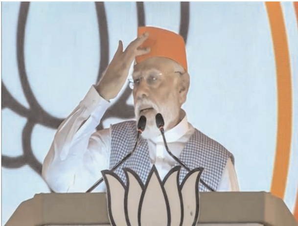
Prime Minister Narendra Modi speaking at a podium during a rally in Barasat.

under the pressure of touts, can never provide security to sisters and daughters. On the other hand, there is the BJP-led central government, which has made provisions for even death penalty in case of serious crimes like rape." The prime minister also slammed the Mamata Banerjee-led party for its failure to implement central initiatives such as a women's helpline, designed to aid them in distress. "We had created this helpline so that our sisters can easily complain in times of crisis. However, the TMC government is not allowing this system to be implemented here. Such an anti-women government can never do any good for women," he said. He described the TMC as a hindrance to Bengal's development and urged the electorate to reject the opposition bloc INDIA and vote in favour of the BJP. "Bengal is faced with an eclipse called TMC. Therefore, all of you, the sisters and mothers, have to defeat the opposition alliance and make the lotus bloom in every corner of the country," the prime minister said.