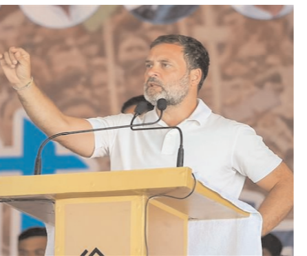
Rahul Gandhi speaking at a podium during a public event.

be constructed between Manali and Leh that will reduce distance and cut travel time considerably," he said. He said the list of development works in the state was long and the major works on priority were completion of the Kiratpur-Manali four-lane highway, construction of bridges over Govind Sagar near Lathiani and Swan river, both in Una district, and the construction of the Matour-Shimla four-lane highway. Speaking on the occasion, Anurag Thakur, Minister for Information and Broadcasting, said of Rs 4,000 crore works that were dedicated by Gadkari, Rs 3,000 crore were in Hamirpur parliamentary constituency. He said he was thankful to the minister for sanctioning development works generously. PWD minister Vikramaditya Singh requested Gadkari to release funds committed by him during his previous visit to the disaster-affected areas.