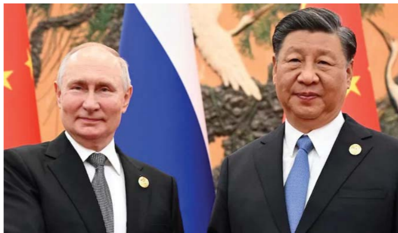
take into account what you just said," Putin responded with a smile, according to TASS.

"I will definitely - without any jokes -